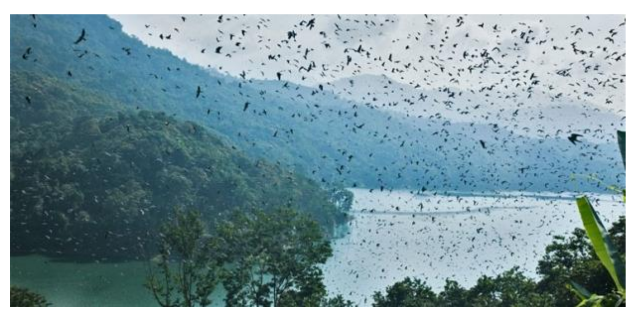
Raptors such as Amur Falcon could benefit from the new agreement